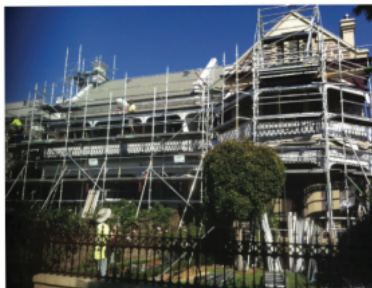
Free Quotes & Erection Service