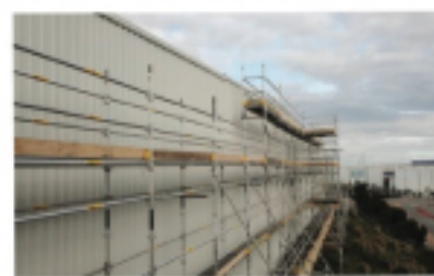
Residential & Commercial

5-7 Peekarra Street, Regency Park SA 5010